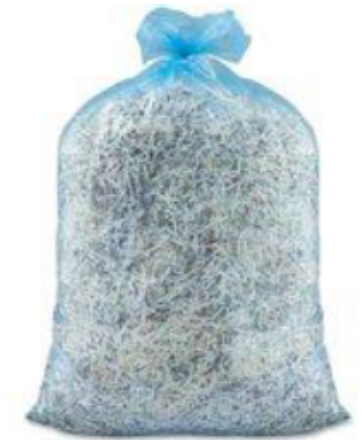
Shredded Paper in clear bags