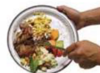
Food and Garbage