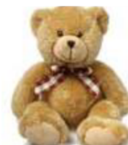
Toys and Clothing