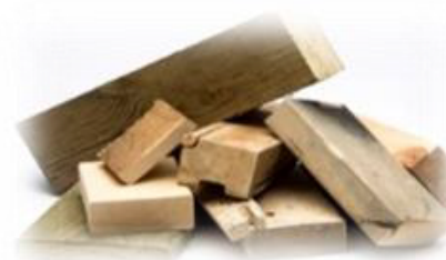
Wood and Metal Scrap