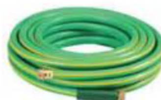
Hoses and Rubber Items