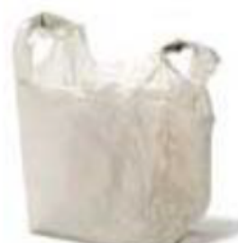
Plastic Bags and Stretch Wrap