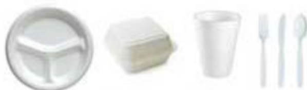
Styrofoam and Plastic Utensils