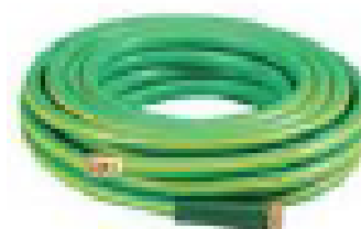
Hoses and Rubber Items