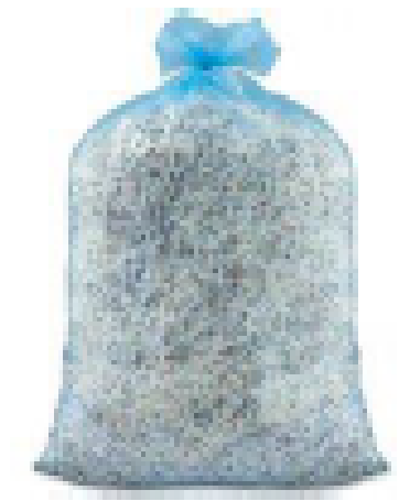
Shredded Paper in clear bags