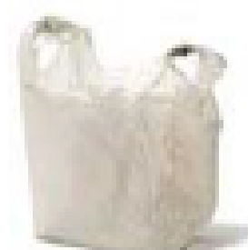
Plastic Bags and Stretch Wrap