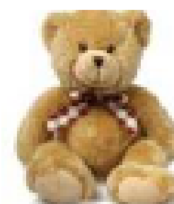
Toys and Clothing