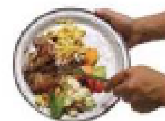
Food and Garbage