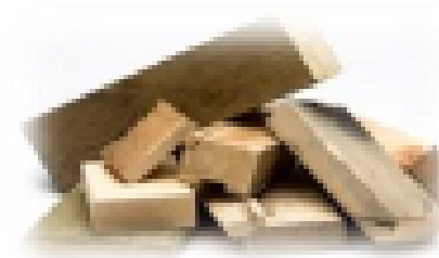
Wood and Metal Scrap