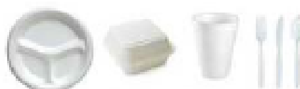
Styrofoam and Plastic Utensils